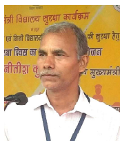
By: Er. Prabhat Kishore

In a democracy, such as ours, the existence and growth of any business eventually depends, not only on the public support in purchasing its products and services, but more importantly on the sanction of the general public.